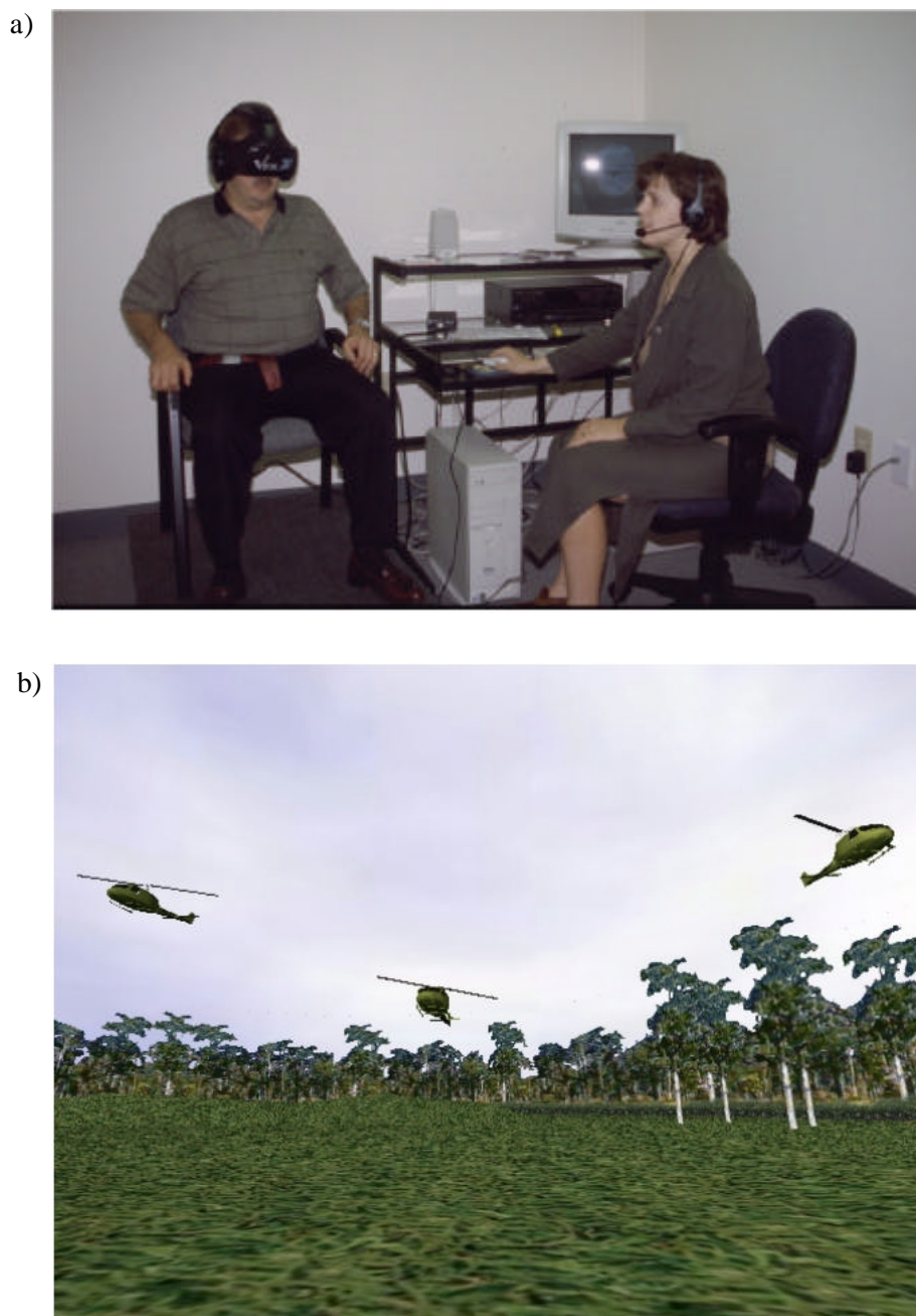
Fig. 4. Virtual Rehabilitation of patients with cognitive deficits: (a) office visit; (b) virtual scene used in desensitizing Vietnam veterans [7].

For all its benefits, Virtual Rehabilitation does pose significant challenges for its widespread adoption. The first is clinical acceptance , which is conditioned on proven medical efficacy and a proactive therapist response. Medical studies are underway, and not enough data exist to satisfy critics that VR-augmented or VR-based rehabilitation is viable. In all fairness it should be said that initial