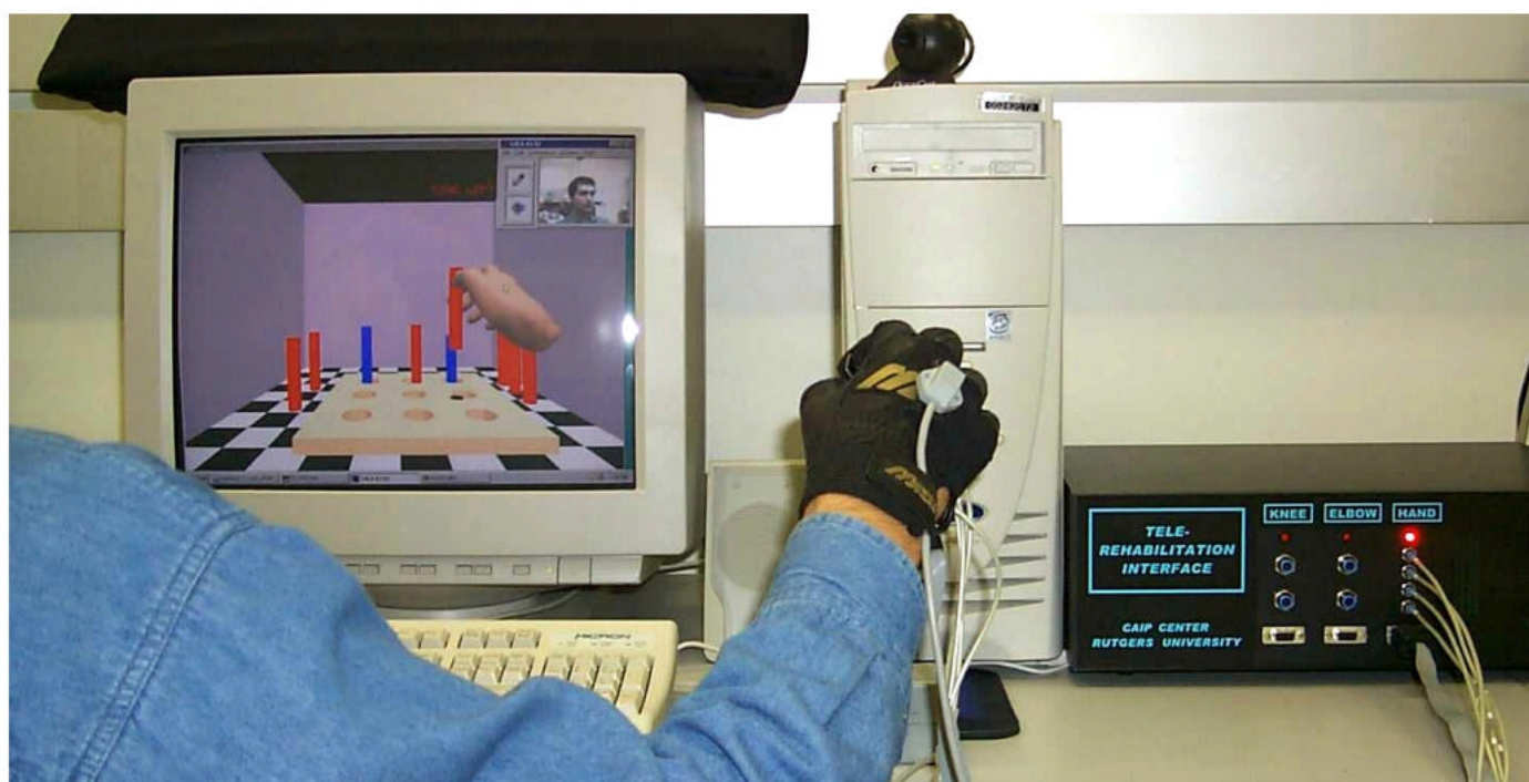
Fig. 2. The VR-based orthopedic rehabilitation using a haptic glove during a peg-board exercise.

done on those patients. For example, the same head-mounted display can be used for patients suffering from "Vietnam syndrome" (a form of post-traumatic stress disorder), as well as for children with attention deficits, or for post-stroke patients. Similarly, the same sensing glove can be used to train musculo-skeletal patients to squeeze "rubber balls," or to do a peg-board exercise. The rubber ball squeezing is a typical hand strengthening exercised prescribed after hand surgery, and corresponds with rehabilitation at the impairment level. The peg-board exercise, such as the one shown in Figure 2 [11], is a procedure done to improve hand-eye coordination (and possibly upper arm extension). It represents rehabilitation done at the (higher) functional level. Of course, there are no real peg-boards, or rubber balls, or any other equipment, except for the haptic glove. Thus a major advantage in all forms of Virtual Rehabilitation is economy of scale .